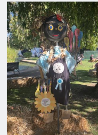
1st Place in 2023 Tee-aL-Cee Croxtton School